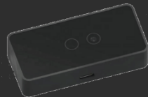
SONY / Sunny Optical